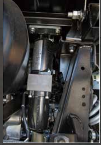
Electric hydraulic bed lift kit (left: dump switch / right: lift cylinder)